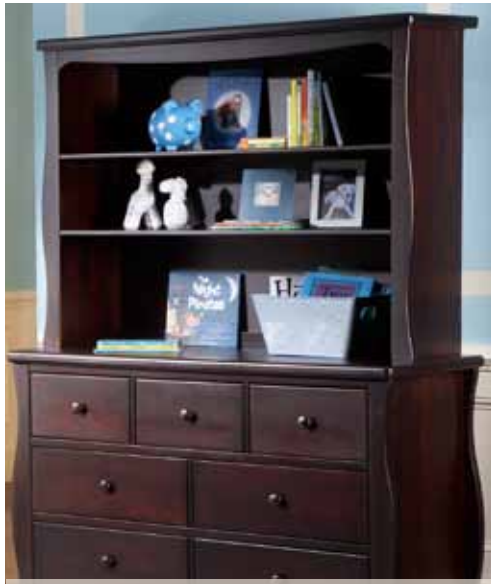
Hutch: 56 1/4" W x 14 3/4" D x 39 7/8" H Double Dresser: 58" W x 32 1/4" D x 50"H Double Dresser and Hutch