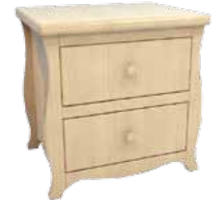
26" W x 20 7/12" D x 26"H Night Stand