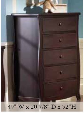
39" W x 20 7/8" D x 52"H 5-Drawer Dresser