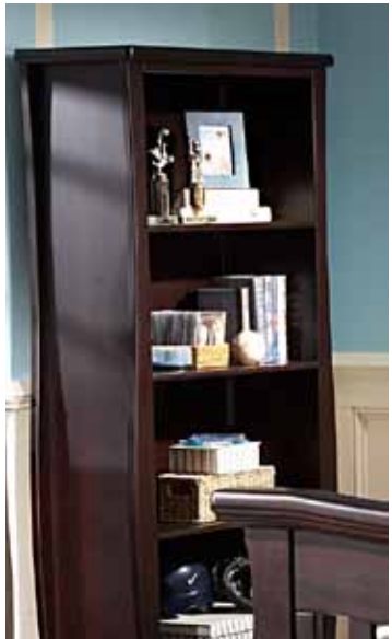
58" W x 32 1/4" D x 50"H Bookcase