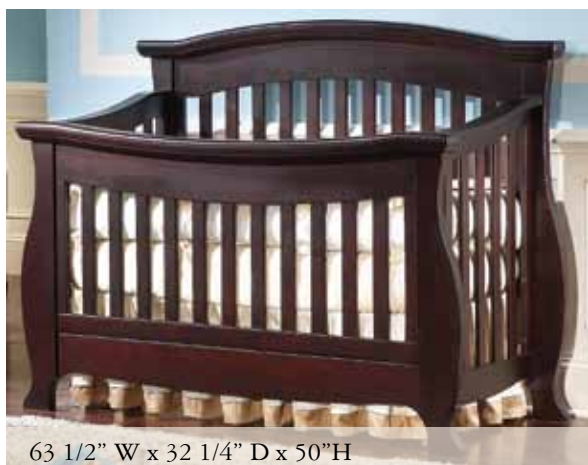
63 1/2" W x 32 1/4" D x 50"H Convertible Crib

Sometimes the smallest things take up the most room in your heart. ~WINNIE THE POOH